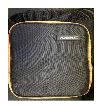
Bag w/Strap - RS02032